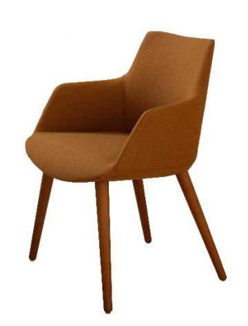
DIVINA, chair with 4 wooden legs.