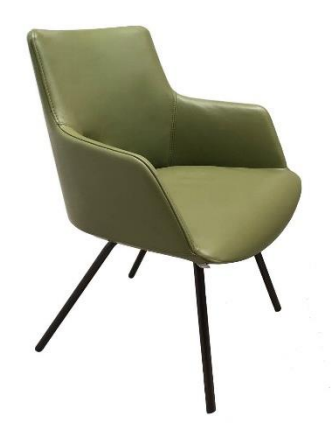
DIVINA, chair with 4 metal legs.