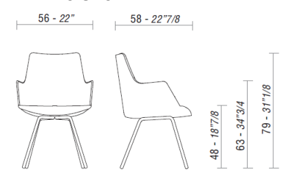
DIVINA, chair with 4 legs.